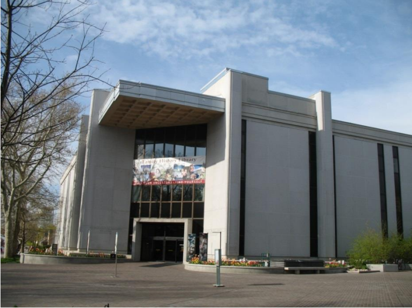
Family History Library, the world's largest genealogical library, in Salt Lake City

Sunday, April 19, to Sunday, April 26, 2015