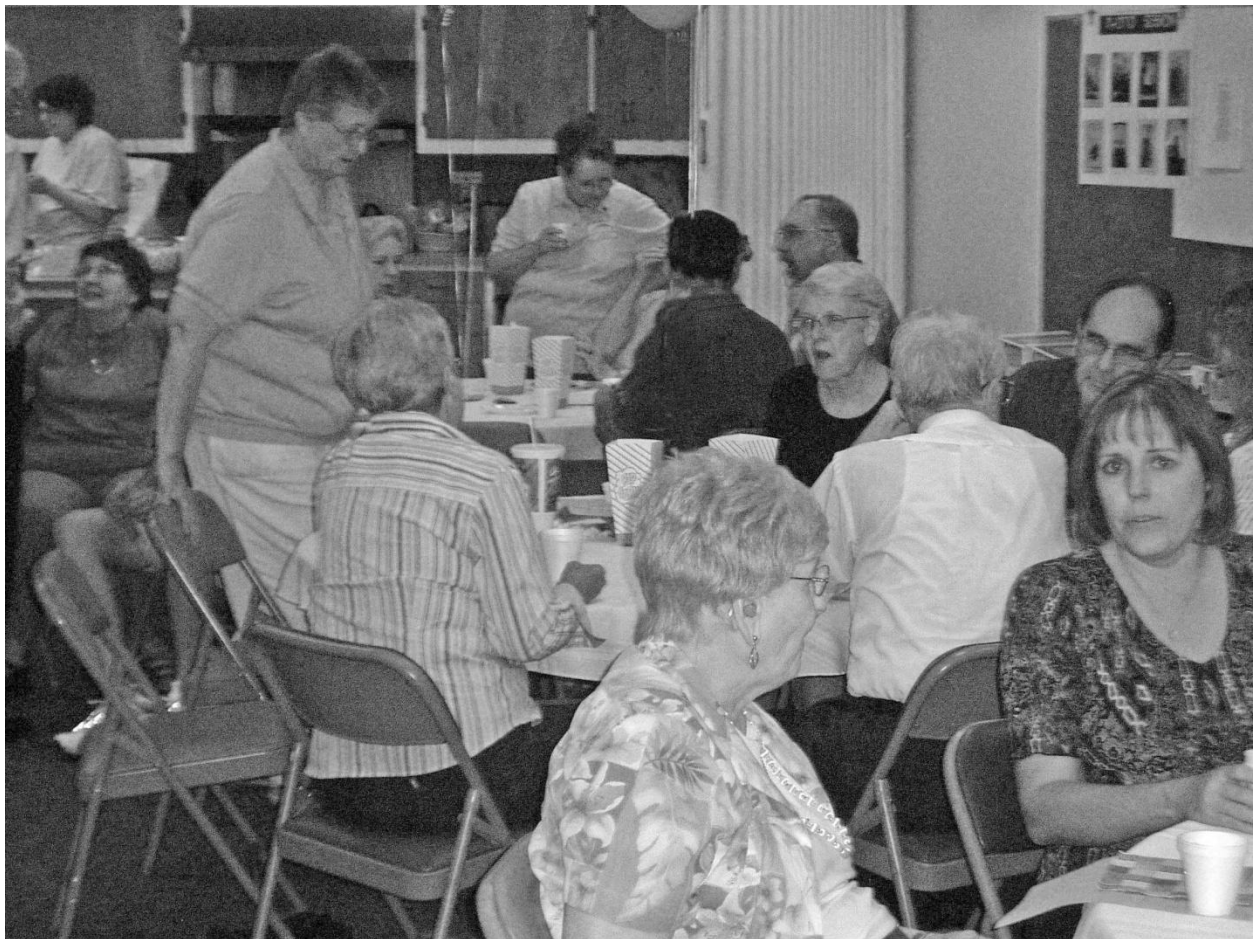
GSSC members enjoying an evening of visiting with friends and talking about their ancestors.